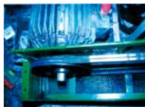
Figure 2: Industrial cogged V-belt drive

Narrow belts have higher power ratings than their classic counterparts due to their greater section depth. The higher the rating of the narrow belts reduces the number of belts required on a drive, improving energy efficiency.