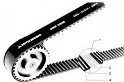
Figure 3: Standard HTD belt construction

The curvilinear profile was originally developed and patented by Uniroyal Inc. These belts have full-rounded, deeper, more closely spaced teeth than a conventional trapezoidal timing belt. The more even distribution of tooth loading to the belt tensile members allows overall higher loading. These belts can transmit up to 450 kW at speeds ranging from 10–4000 rpm and operate at temperatures ranging from -30–85°C.